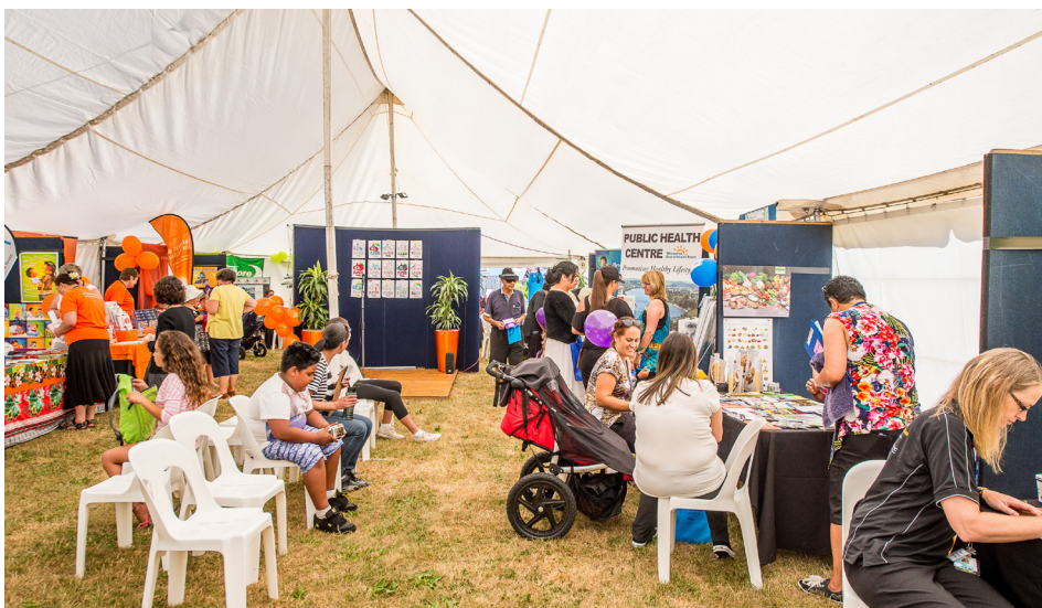
Inside the Whānau Hauora Marquee