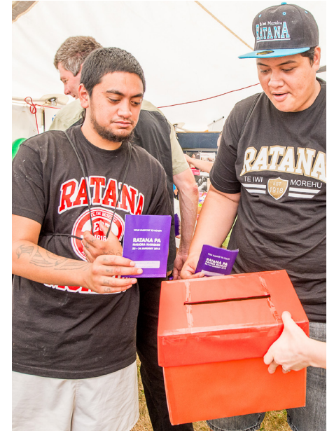
Attendees enter their completed Passport to Health cards into the prize draw.

Prizes, which were donated by stand holders, included restaurant vouchers, a guitar, kid's toys, clothing and cosmetic packs.