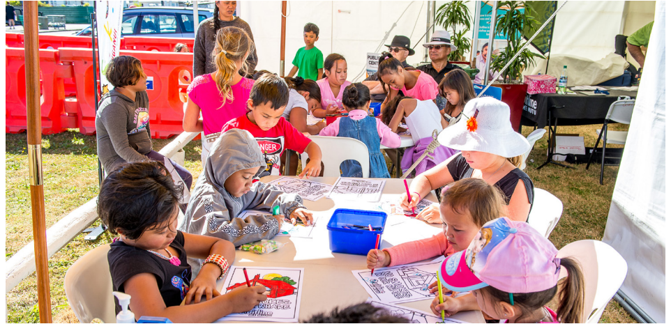
Children take part in the colouring competition in the Tamariki area of the Marquee