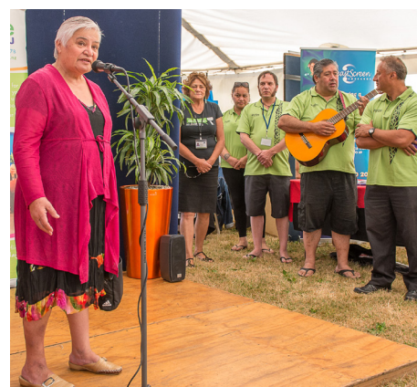
Hon. Dame Tariana Turia opens the Marquee

To measure the effectiveness of the Rātana Pā Whānau Hauora Marquee, the organisations who participated were sent an online survey. In addition the number of people who accessed the Hauora Marquee's services was recorded and Quitline's Event Specialist was interviewed.